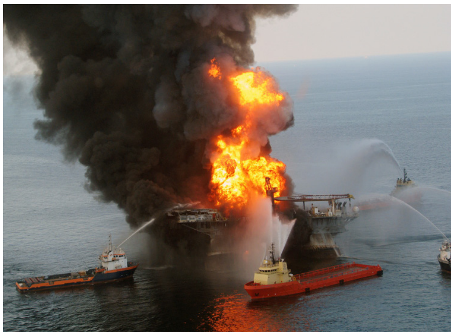
Fire boat response crews battle the blazing remnants of the offshore oil rig Deepwater Horizon in April 2010.

At the time it was the largest oil spill in history and impacted 45 miles of the French coastline with 69 million gallons of crude oil. In route from the Persian Gulf to Rotterdam, Netherlands, the tanker Cadiz got caught