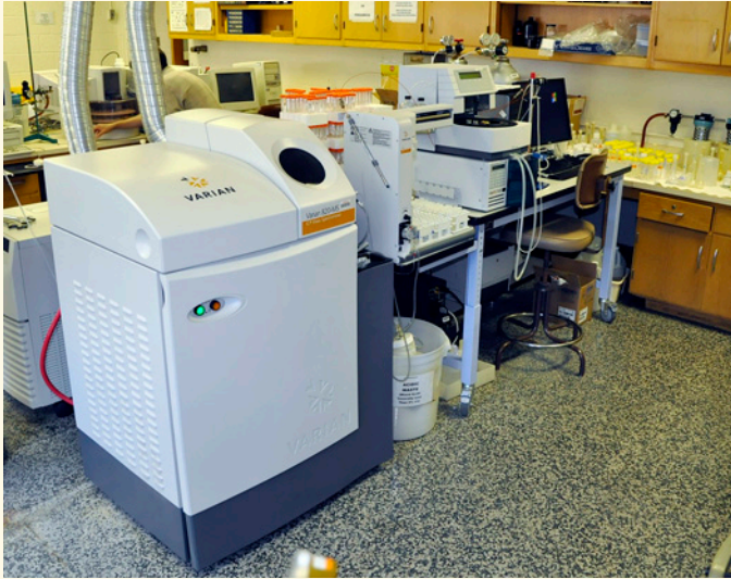
Mass spectrometer at the N.C. State University Soil Science Analytical Spectrometry Services Laboratory (left).