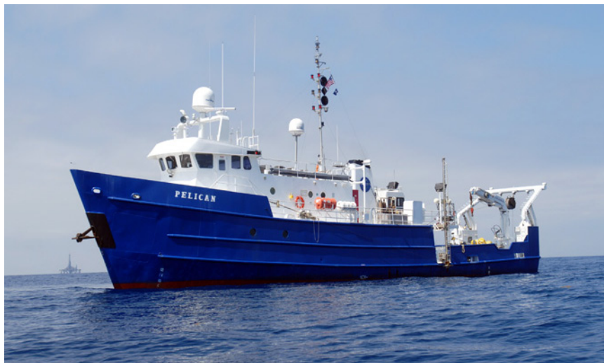
Research vessel Pelican in the Gulf of Mexico.

Hypoxia can cause fish to leave the area; while resulting in stress or death to bottom-dwelling organisms that