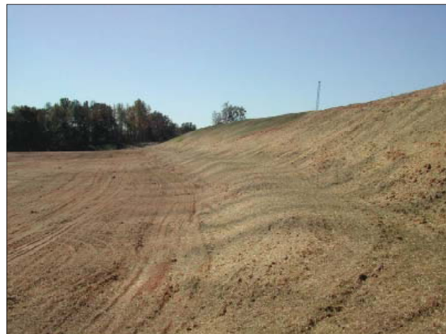
Figure 5. Creating a bench on a slope will slow runoff and help prevent erosion.