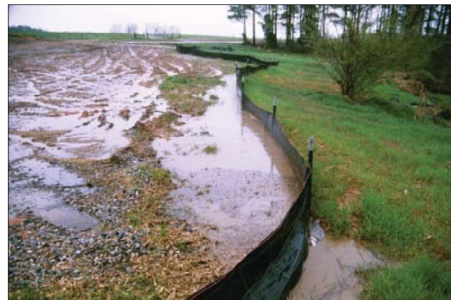
Figure 6. Silt fence sediment control illustrating the ponding necessary to capture sediment in runoff before the site is stabilized with vegetation.