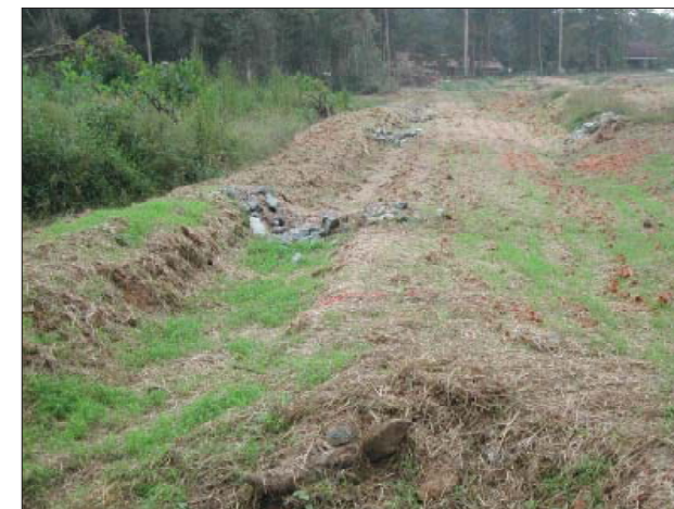
Figure 2. Diversion ditch on the perimeter of a project to prevent clean water from running onto the site and to keep site water from leaving the project without being treated.