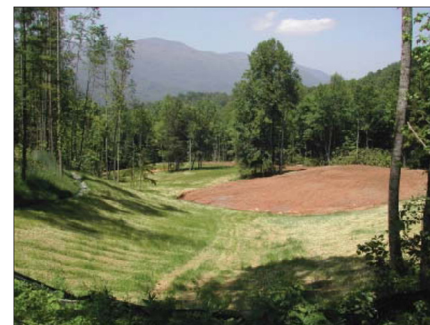
Figure 3. Graded area stabilized with vegetation except in the section being actively worked.

logic characteristics at a previously undisturbed site represent a natural harmony that should be considered, rather than forcing the land to conform to development needs. Maintaining natural slope contours will usually minimize soil disturbance.