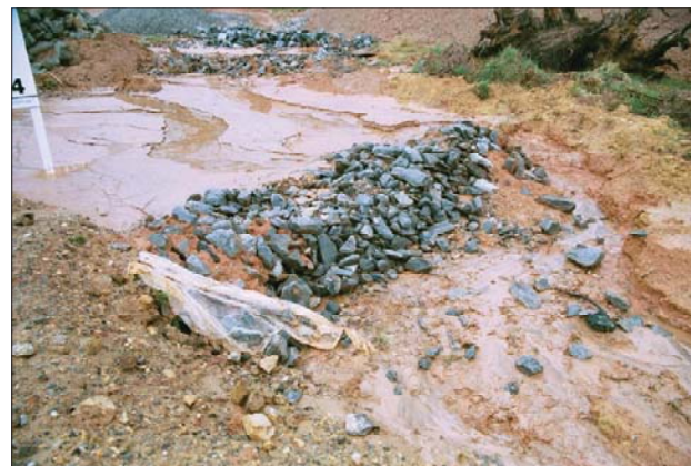
Figure 7. This sediment trap filled completely with sediment and has begun to erode around the rock dam. All sediment trapping devices need to have sediment removed once they are half full.