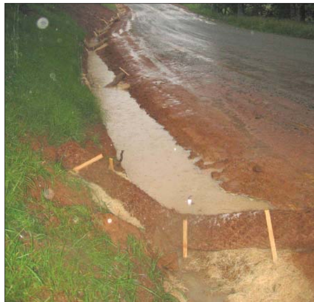
Figure 4. A series of check dams slow runoff in a ditch to prevent scouring.